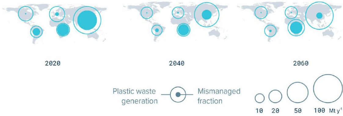
Scenario C - Reduce plastic use and improve waste management